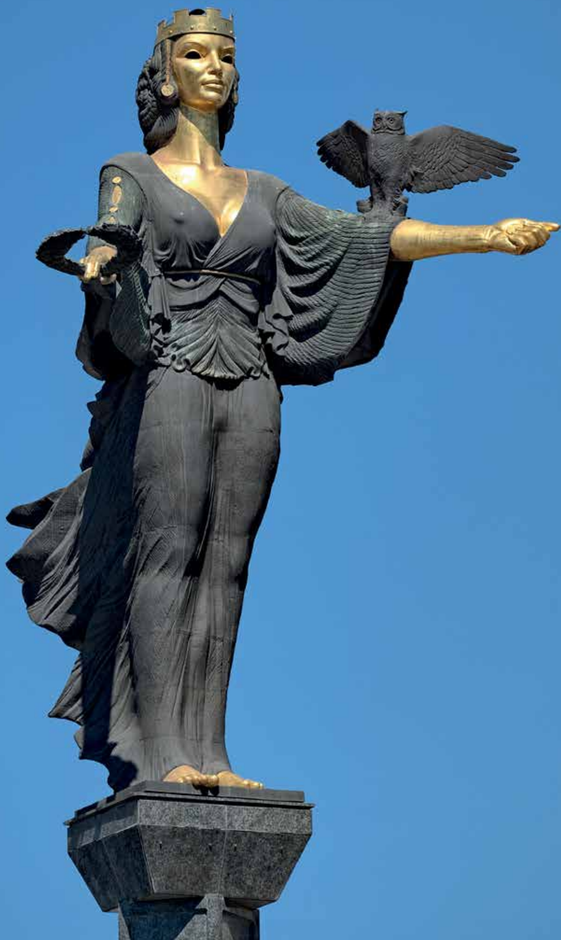
Statue of St Sofia